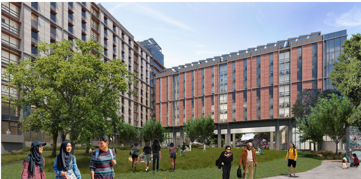
Above: View of the student housing building looking across the Central Glade towards Bowditch Street. Below: Placement of the new housing has been carefully considered to create an expansive sunny meadow with plantings and pathways called the Central Glade.

This project is widely supported by the Berkeley mayor, members of the city council, the media, our neighbors, local churches, faculty experts and professionals who have dedicated their lives to helping and supporting unhoused people. We are grateful for their endorsements.